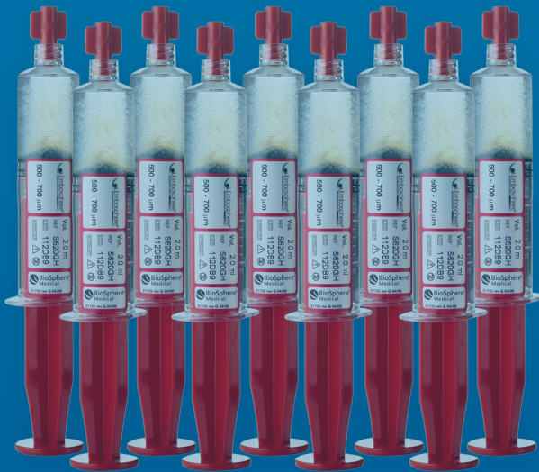
9 mL – Merit Medical Embosphere Microspheres

Contour PVA Particles occluded the uterine artery with 67% less product and equivalent clinical results as compared to Merit Medical Embosphere Microspheres. 1