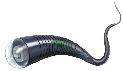
Fathom™ Steerable Guidewire