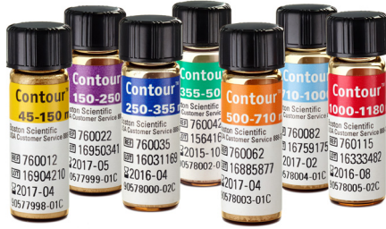
Contour™ Embolization Particles