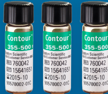
3 mL – Contour PVA Particles